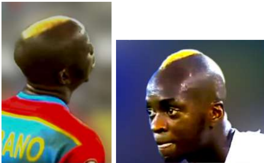
Figure 6. Neeskens Kebano of DR Congo Squad. AFCON, Gabon 2017.