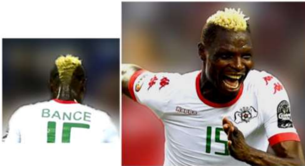
Figure 1. Aristide Bance of Burkina Faso Squad. AFCON, Gabon 2017.

juxtaposition of blond colourant from the front to the back of the head creates an implied line of black hairs traversing from the front to the back of his head. The sides of the head show down-cut hairs that expose the skin. Kabananga's hairstyle stands erect, thorny scaled and rastarised. Rasta effects armours his style with strong texture.