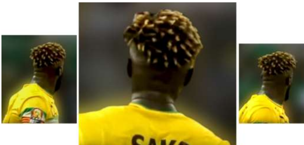
Figure 2. Bakary Sako of Mali Squad. AFCON, Gabon 2017 [motion picture].