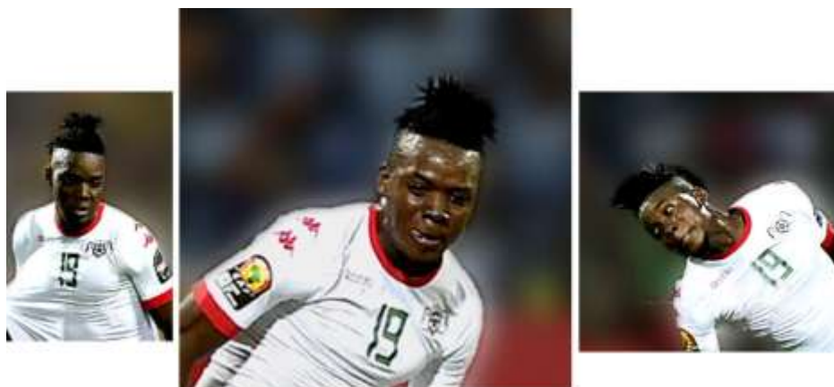
Figure 10. Bertrand Traoré of Burkina Faso Squad. AFCON, Gabon 2017.

part of the rastarised hair on the crown adds more height to the hairstyle. Khama Billiat has romanticised arc-shaped hairstyle. From the front, the implied arc-shaped line moves through the middle of the crown and diverts to the direction of the left ear (Figure 11). To heighten the intensity of the curvilinear arc-like line, hairs at far and near it have been cut almost to the skin. A thin line demarcates the peripheries of the line. His style is distinctive and awesome.