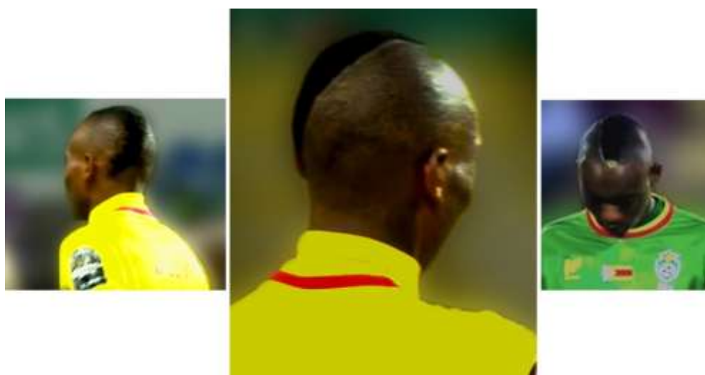
Figure 11. Khama Billiat of Zimbabwe Squad. AFCON, 2017.

The varying hairstyles of the players be it rastarised, braided, haircut, dyed, or a combination of two or more hairstyling techniques, contributed to give simulated coarse texture. When these textual qualities are achieved, it stirs up viewers' attention. The power of lines was also used to give multi-directional interest in their hairstyles.