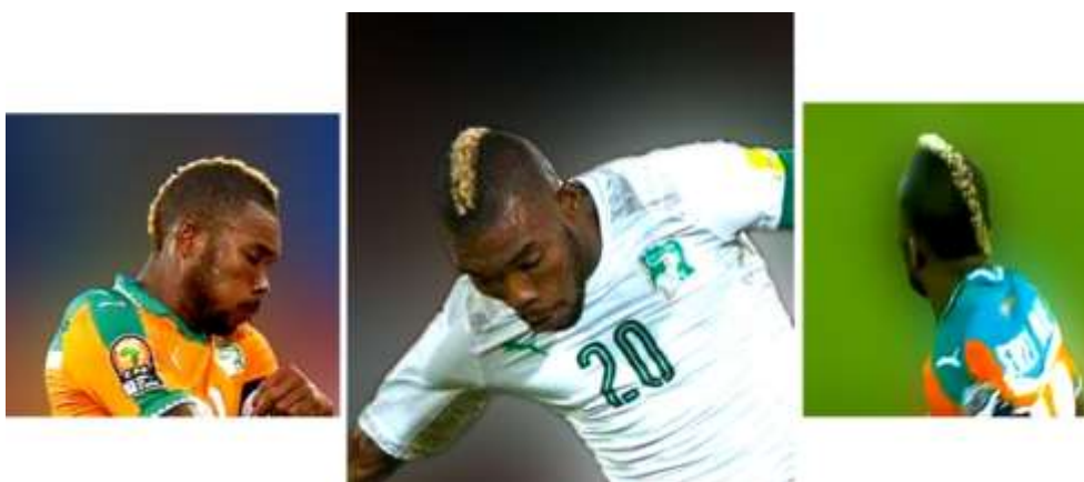
Figure 9. Serey Dié of Ivory Coast Squad. AFCON, Gabon 2017.