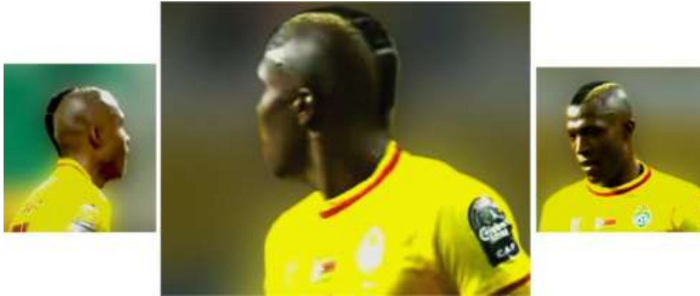
Figure 7. Tendai Ndoro of Zimbabwe Squad. AFCON, Gabon 2017.