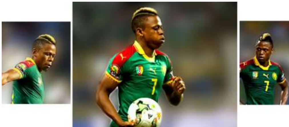
Figure 5. Clinton Njie of Cameroon Squad. AFCON, Gabon 2017.

view, the blond coloured hairs that visually halves the head into two, has idealised serrated textural quality.